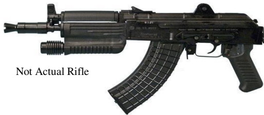
Not Actual Rifle