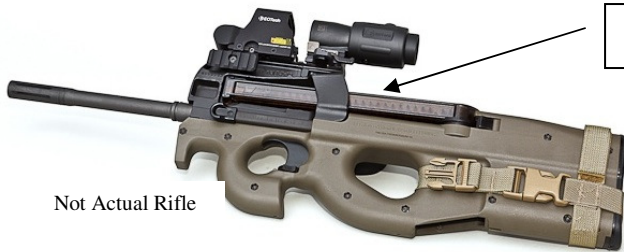
Not Actual Rifle